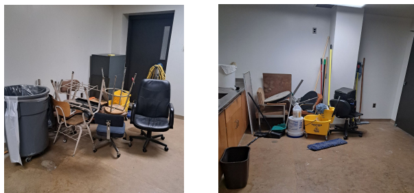
Figure 1: Each picture shows the NASRED after doing some initial cleaning of the space.

Overall, the investments in physical, institutional, and information infrastructure supported by the DOE-RENEW grant have been transformative for Morgan State University’s nuclear physics program. These advancements provide the necessary foundation for sustained research excellence, workforce development, and meaningful scientific contributions aligned with the Department of Energy’s goals. The strengthened infrastructure ensures that Morgan State is well-positioned to contribute to future discoveries and maintain productive partnerships within the national scientific community